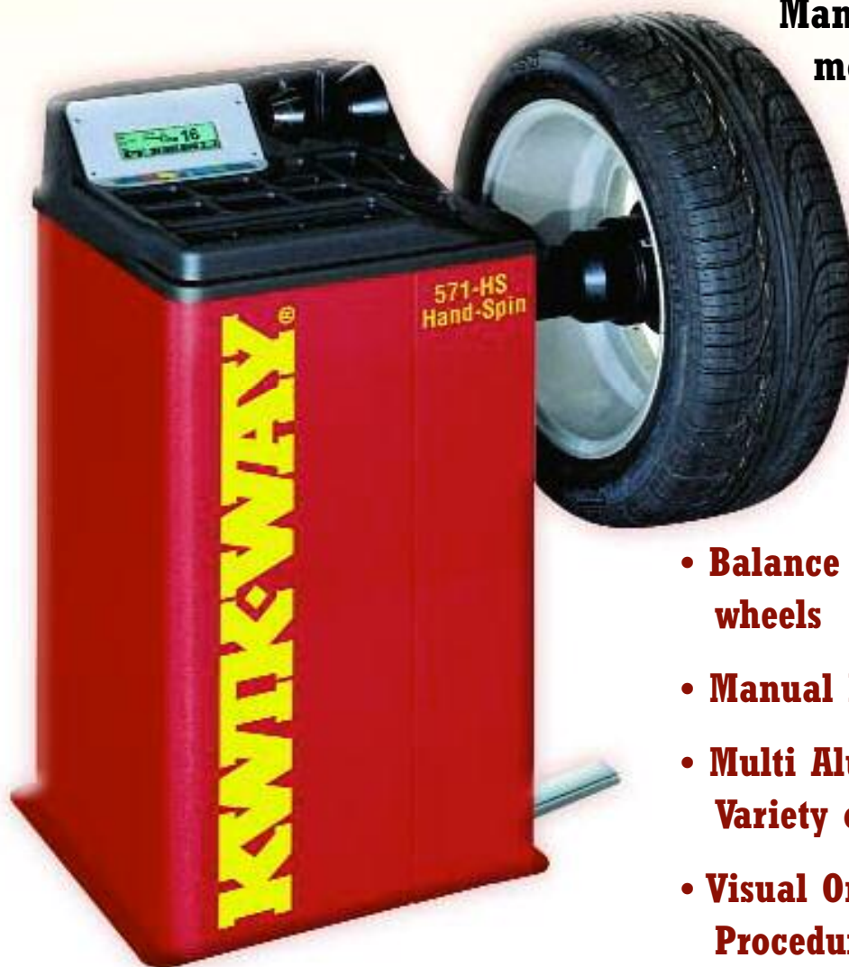
Model 571-HS Hand-Spin Wheel Balancer

Many of the features of the more expensive balancers