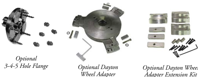
Optional 3-4-5 Hole Flange