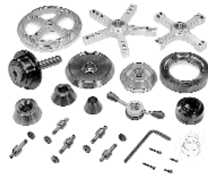
Automotive/Truck Cone Set (Standard)