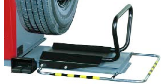
Automotive/Truck Cone Set (Standard)