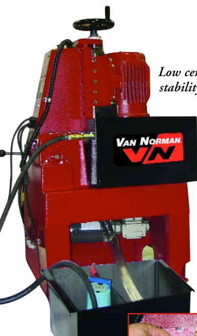
Low center of gravity for stability and portability.