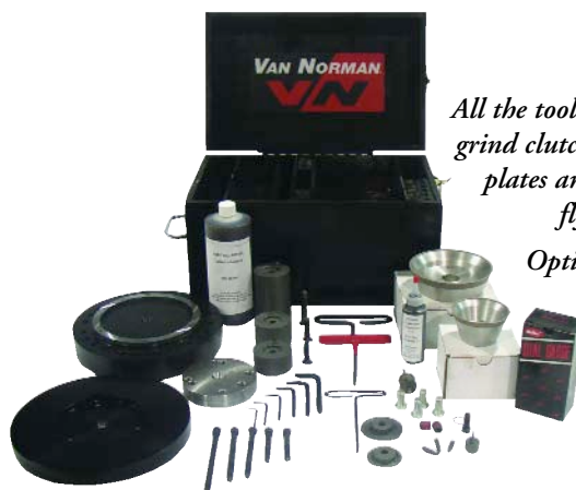
All the tooling necessary to grind clutch discs, pressure plates and racing-style flywheels.